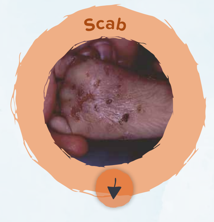
When skin sores have a scab, you have to take medicine to kill the germs.